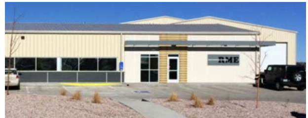
This new energy-efficient building, financed through SBA, is expected to reduce RME's energy costs by 10%.

American communities. 504 Loans provide long-term fixed asset financing to small businesses to purchase or improve land, buildings, and major equipment, in an effort to facilitate job creation and local economic development.