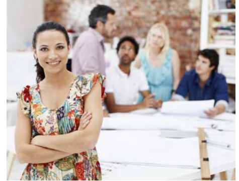
Energy efficiency can save money, enhance customer experience, and boost profits for your small business.

In the meantime, consider the low- or no-cost energy efficiency measures (EEMs) on page 2 that are common solutions in small buildings.