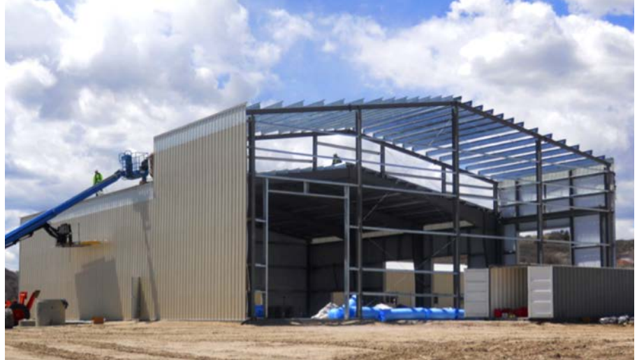
14 years of excavating in the Flathead Valley! RME can get the job done right, from helping you plan your property layout to the rough landscaping.

RME's 504 Loan is an SBA financing program established to target companies in their growth cycle to create jobs, expand their tax base, and improve